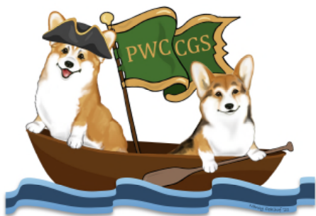
Cross the Delaware to the Garden State Specialty

27th & 28th Annual Specialty Shows 19th & 20th Independent Specialty Shows